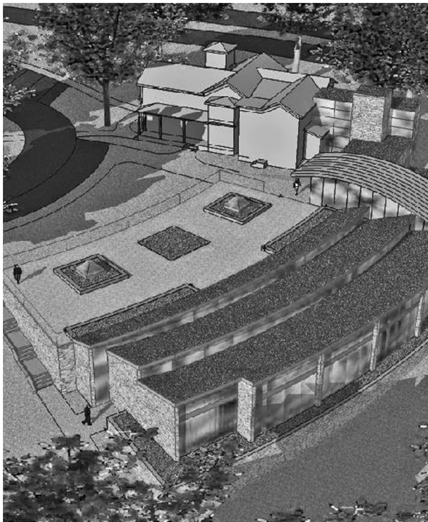
Planning the Museum Addition (see p. 6)