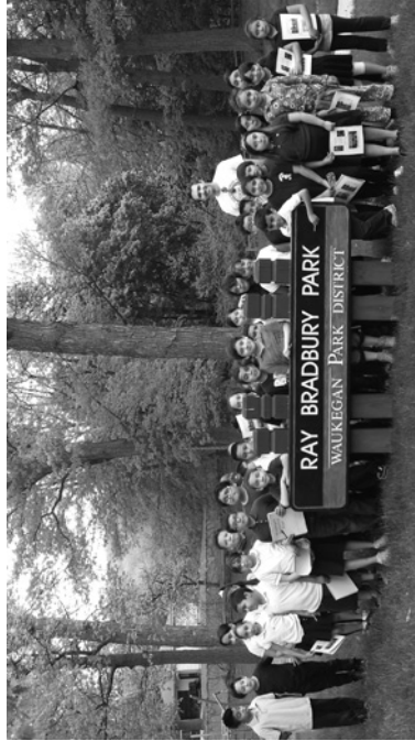
Glen Flora third grade students on a bus and walking tour of Waukegan