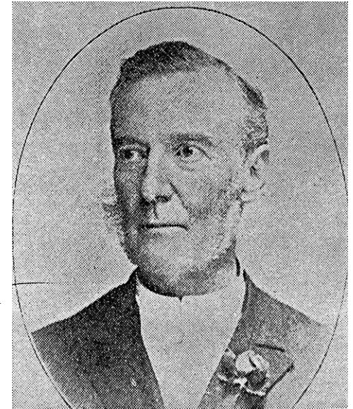
Elisha P. Ferry

Even with all this, he worked as a banker for a time.