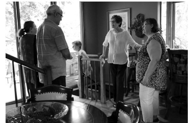
2016 Tour of Homes