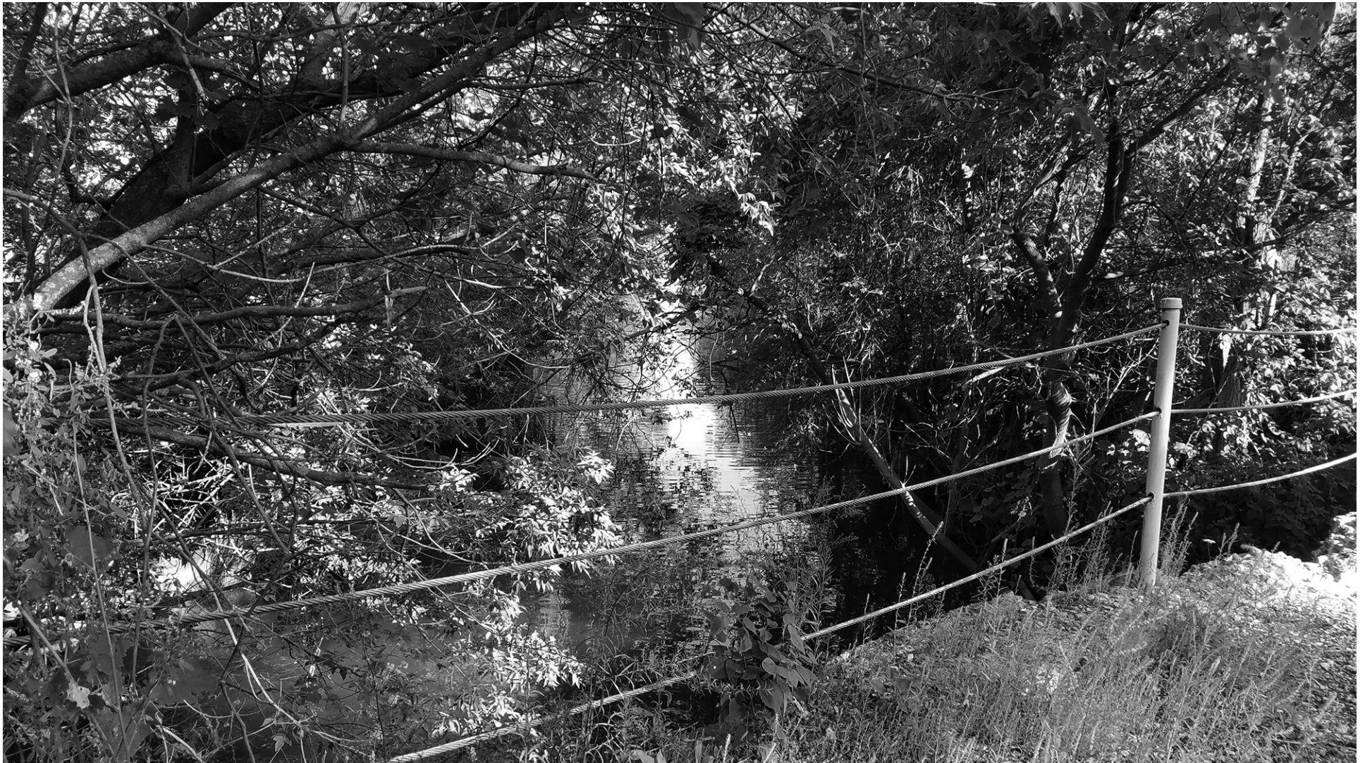
Last Leg Before the River Flows into Lake Michigan

There is an excellent video on YouTube of a man canoeing from what looks like Washington Park and through various tunnels under Genesee Street and Sheridan Road to enter Lake Michigan and even paddle through Waukegan Harbor. The sound track choreographs nicely with when he capsizes before one tunnel and then has to walk his canoe through a tunnel. Look it up.