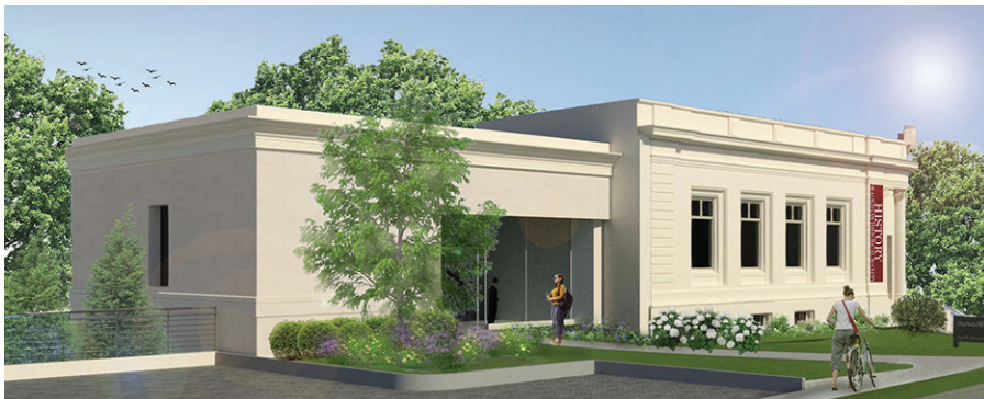
Rendering by Harboe Architects of building addition for accessibility.