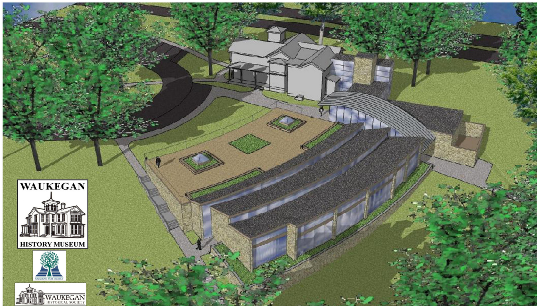
Conceptual plan for expansion of the Waukegan History Museum.