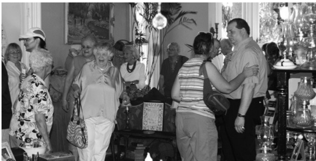
2013 Tour of Homes participants enjoying 946 N. Sheridan Road.

May 17, 2014 – Waukegan Historical Society Annual Meeting and Luncheon: