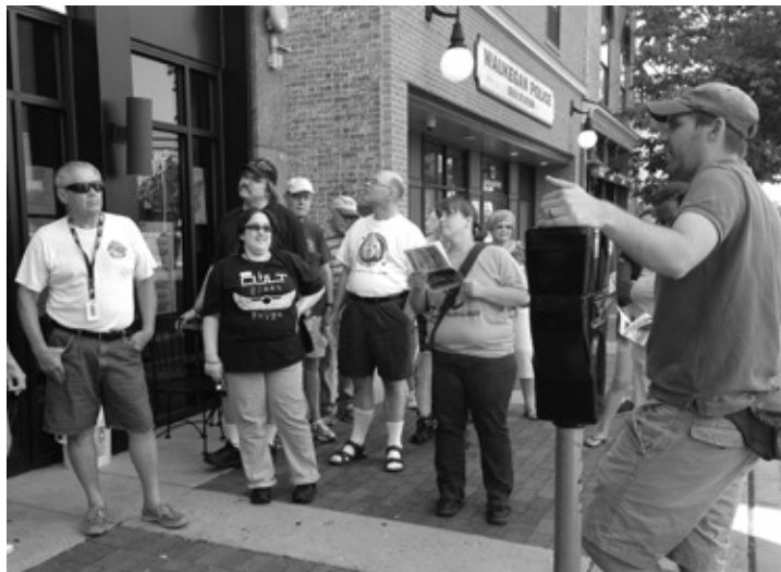
Participants on the guided walking tour "Waukegan's Civil War Sites."

Remembering Our Veterans – November 9, 2013